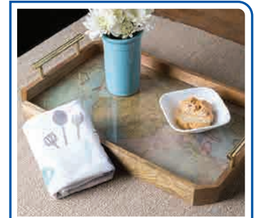
BEAUTIFY ARTS & CRAFTS